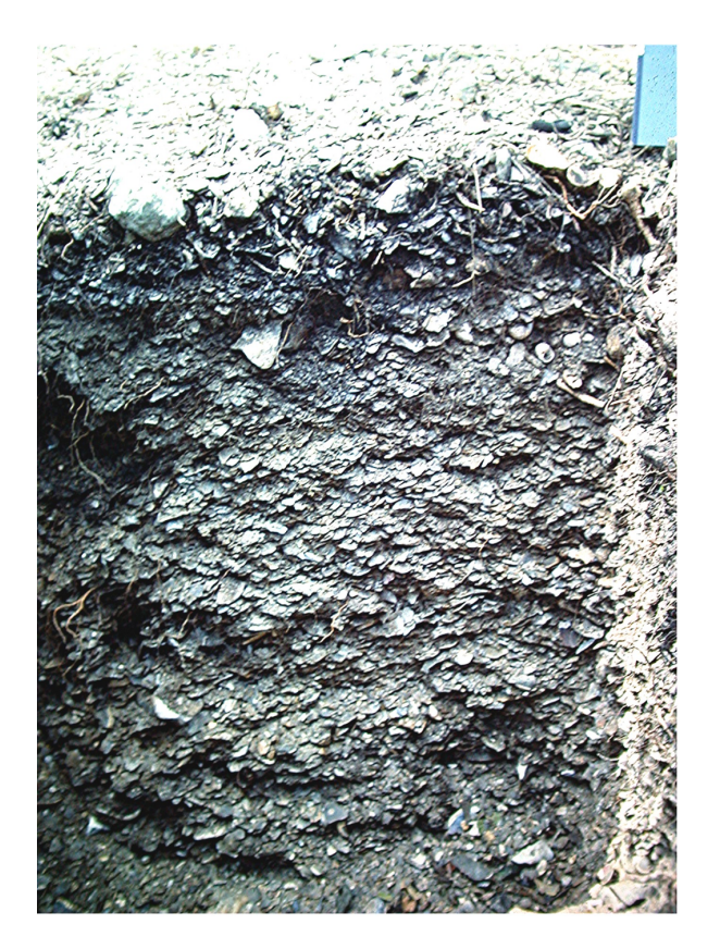
Figure 5. Profile of a Classic Period lithic workshop deposit at Colha, Belize, showing the extent of debitage.

Numerous Late Preclassic, Classic, and Early Postclassic lithic workshops were sampled over the years ((Figure 5). Production estimates for the workshops is in the millions and Colhamade tools were traced to many sites in northern Belize and beyond (Hester and Shafer 1991; Shafer and Hester 1983; Shafer and Oglesby (1980). We were able to show the regional distribution and consumption of Colha-made tools at consumer sites by analyzing lithic collections from numerous sites across northern Belize (Figure 6) (Dockall and Shafer 1993; Hester and Shafer 1994; Shafer 1983b; Shafer and Hester 1991).