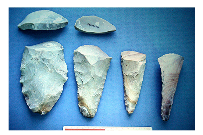
Figure 4. Examples of tranchet flake artifacts from Colha, Belize.

Figure 3. Bit angle formed by the removal of a tranchet flake.