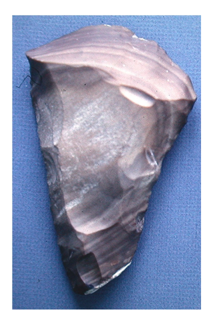
Figure 6. Tranchet axe from Pulltrouser Swamp in northern Belize.

that the tranchet flake was the key to opening the mysteries of Maya industrial lithic technology.