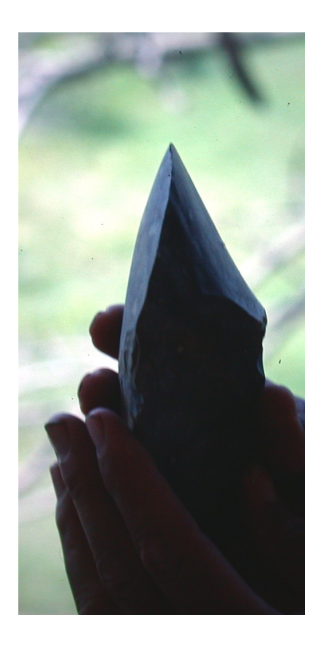
Figure 3. Bit angle formed by the removal of a tranchet flake.